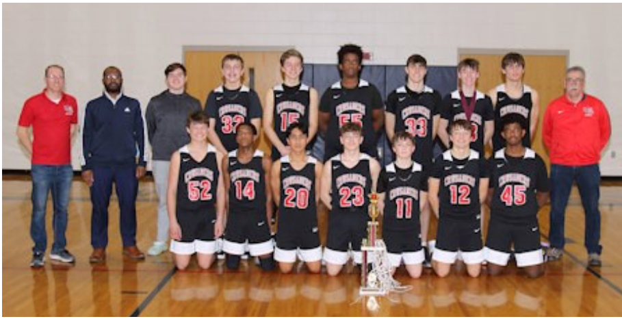
1st Place—Rosemount Crusaders