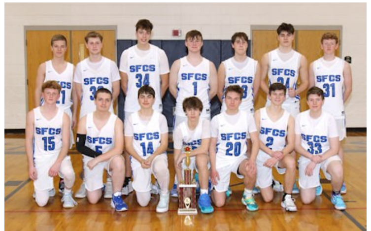
2nd Place—St. Francis Patriots