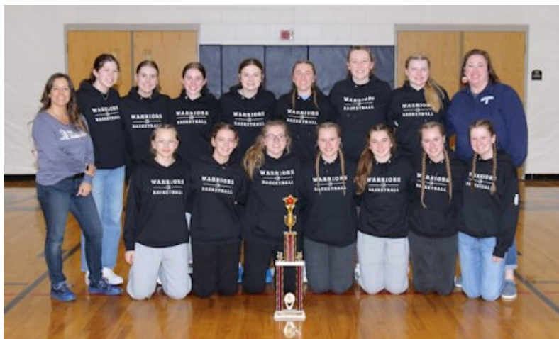
1st Place—Fourth Baptist Lady Warriors