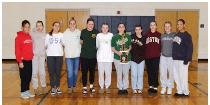
2nd Place—Woodcrest Lady Warriors